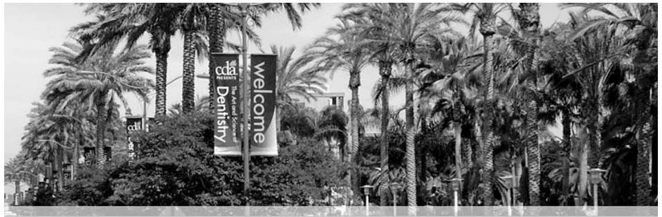
CDA Presents: Anaheim Attendee Resources