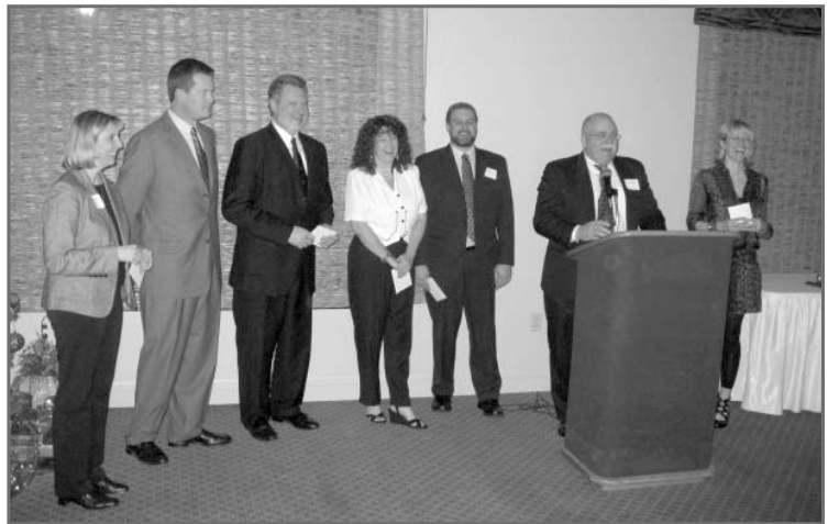
Apparently it WAS a laughing matter!