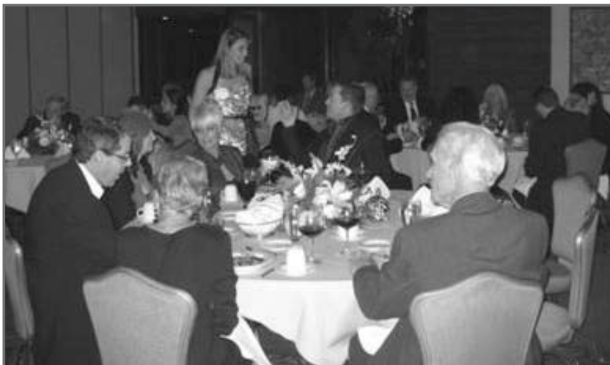
SDS Members enjoying their evening